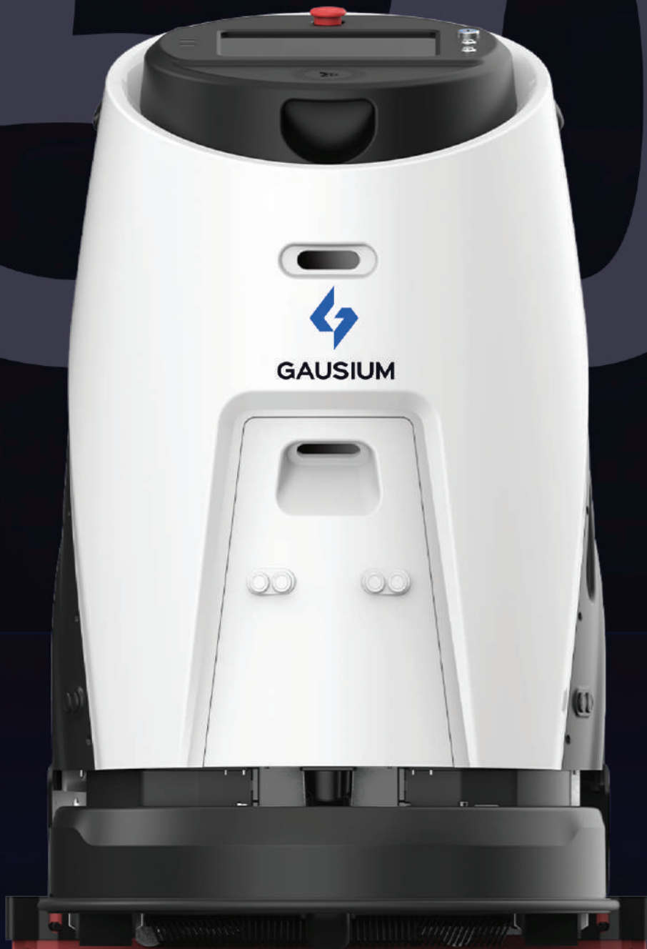
Scrub 50 AI-Powered Robotic Floor Scrubber