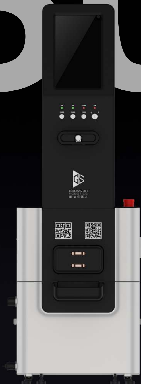
Workstaion 50 Scrubber 50 Pro V1-V2 Accessory